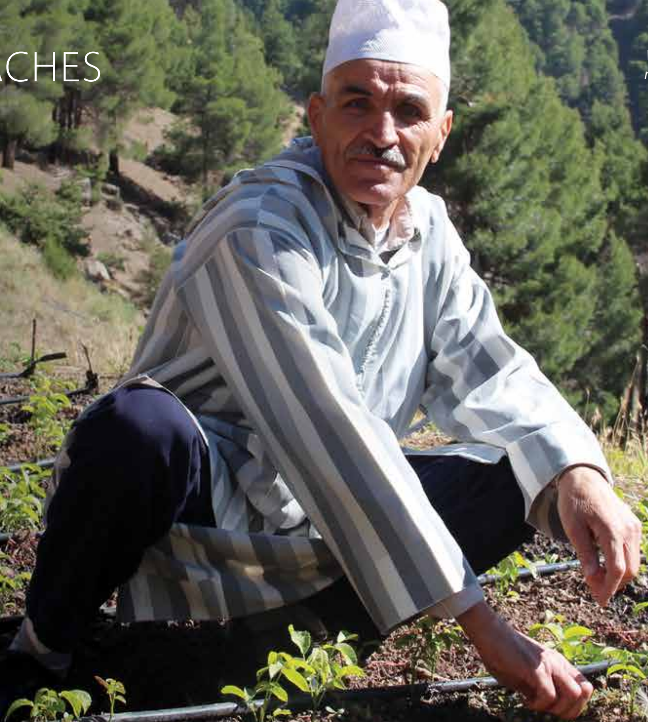
Walnut cultivation to rehabilitate degraded soils and reforest land in the High Atlas Mountains in Morocco.

water management, and climate resilience approaches. In this strategic initiative, SGP incorporates agroecological practices to reduce greenhouse gas emissions and enhance resilience in critical landscapes that are suffering declining productivity as a result of human-induced land degrading practices.