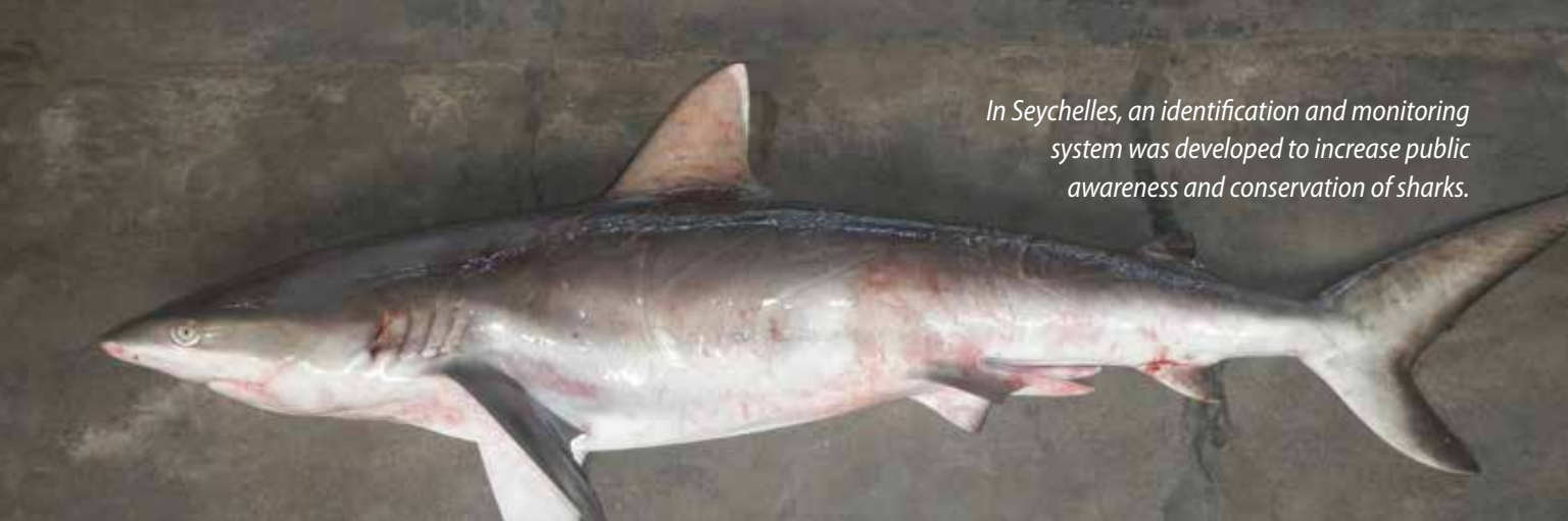
In Seychelles, an identification and monitoring system was developed to increase public awareness and conservation of sharks.