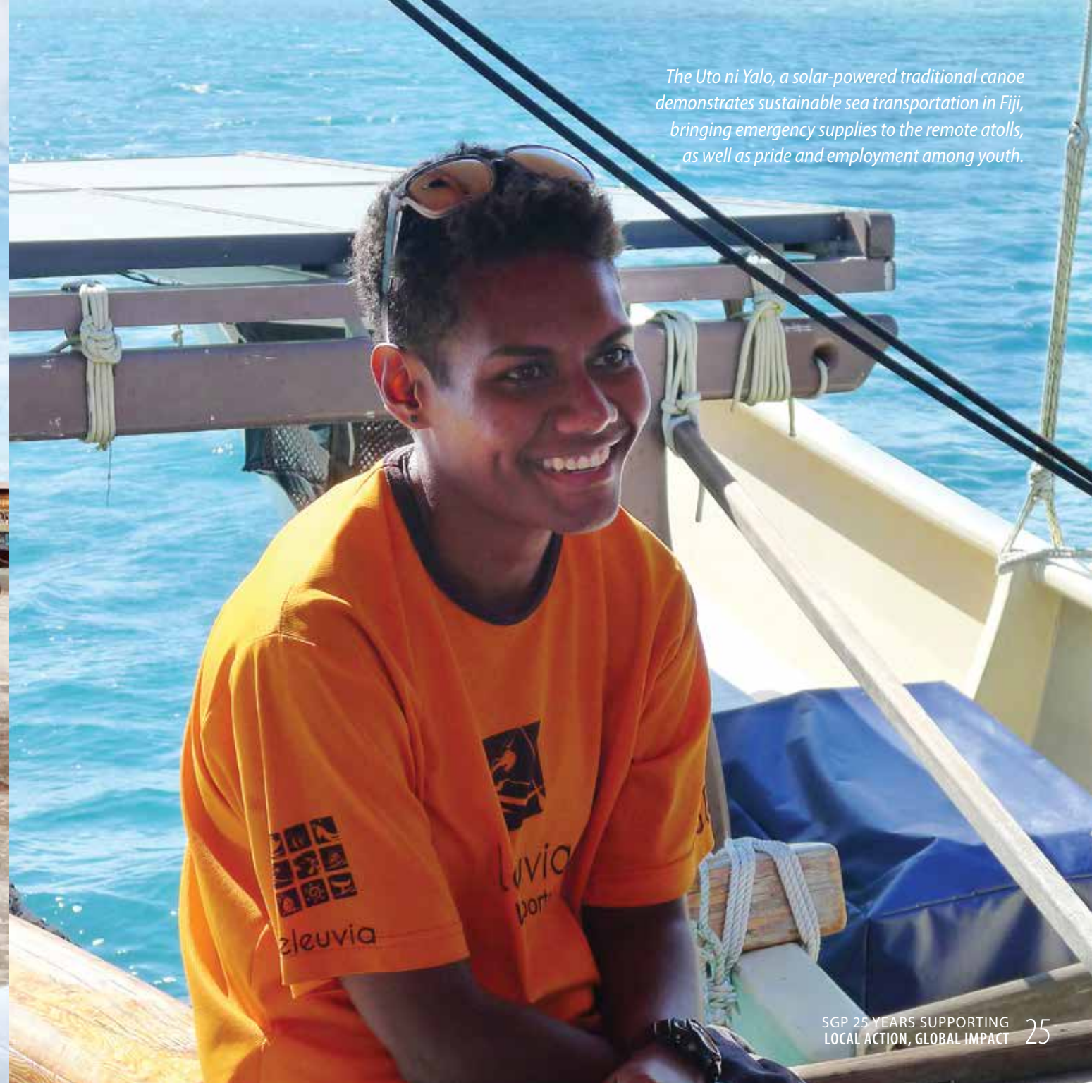
The Uto ni Yalo, a solar-powered traditional canoe demonstrates sustainable sea transportation in Fiji, bringing emergency supplies to the remote atolls, as well as pride and employment among youth.